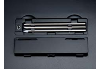
Two Replacement Ink Cartridges and One Plastic Pen Tip in the Cartridge Compartment